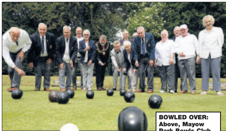
BOWLED OVER: Above, Mayow Park Bowls Club marked the opening of its new facilities with Lewisham Mayor Sir Steve Bullock as special guest