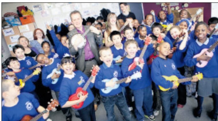
STRING TIME: Funnyman Frank Skinner dropped in on children at Childeric Primary School in Childeric Road, New Cross, to teach them how to play the ukulele e8052/C